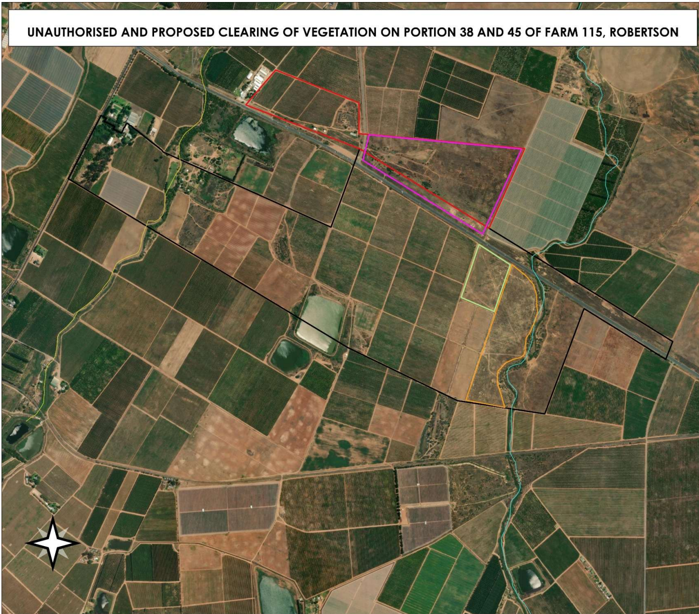
Figure 2: Site Plan